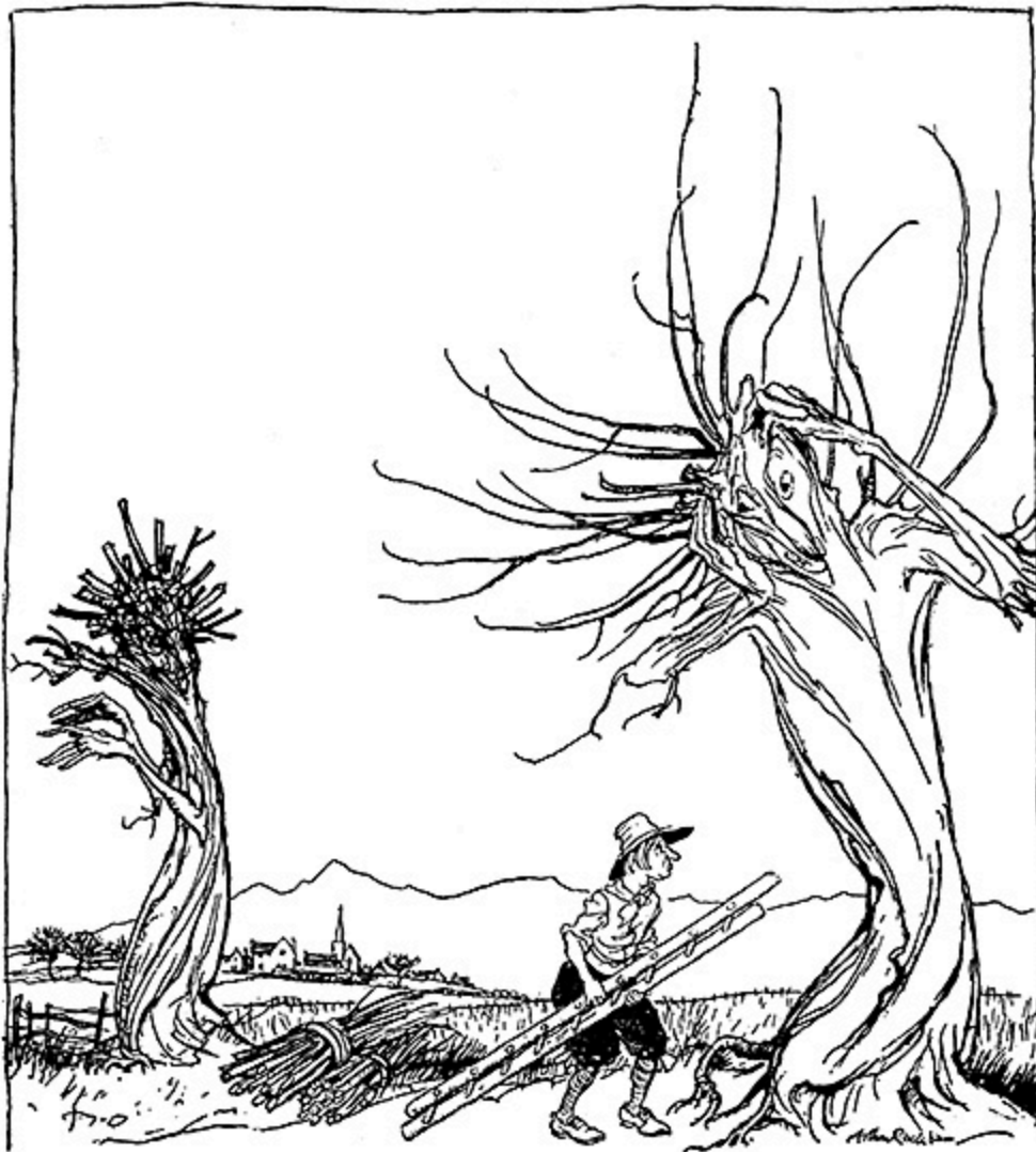
Very subject to marvellous events and appearances.