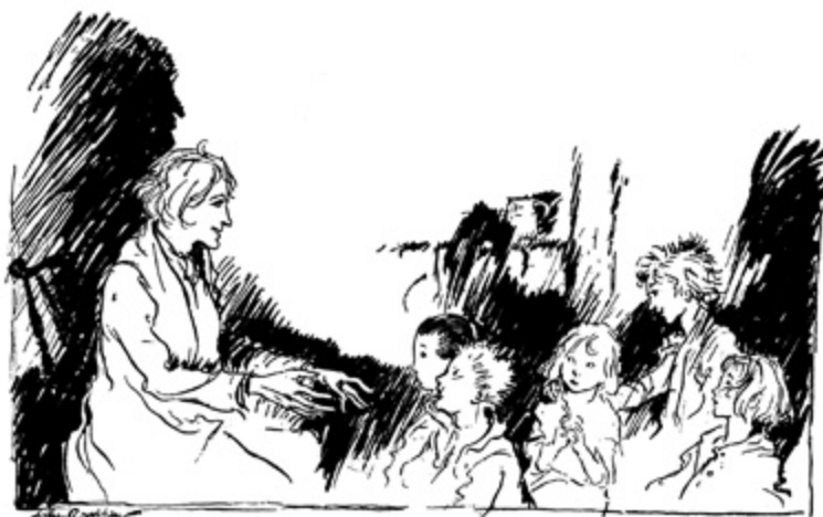
Long stories of ghosts, witches, and Indians.

The great error in Rip's composition was an insuperable aversion to all kinds of profitable labour. It could not be for want of assiduity or perseverance; for he would sit on a wet rock, with a rod as long and heavy as a Tartar's lance, and fish all day without a murmur, even though he should not be encouraged by a single nibble. He would carry a fowling-piece on his shoulder for hours together, trudging through woods and swamps, and up hill and down dale, to shoot a few squirrels or wild pigeons. He would never refuse to assist a neighbour even in the roughest toil, and was a foremost man in all country frolics for husking Indian corn, or building stone fences; the women of the village, too, used to employ him to run their errands, and to do such little odd jobs as their less obliging husbands would not do for them. In a word, Rip was ready to attend to anybody's business but his own; but as to doing family duty, and keeping his farm in order, he found it impossible.