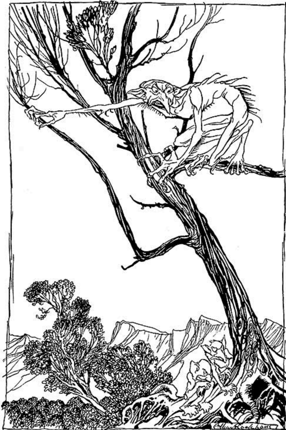
The Kaatskill mountains had always been haunted by strange beings.