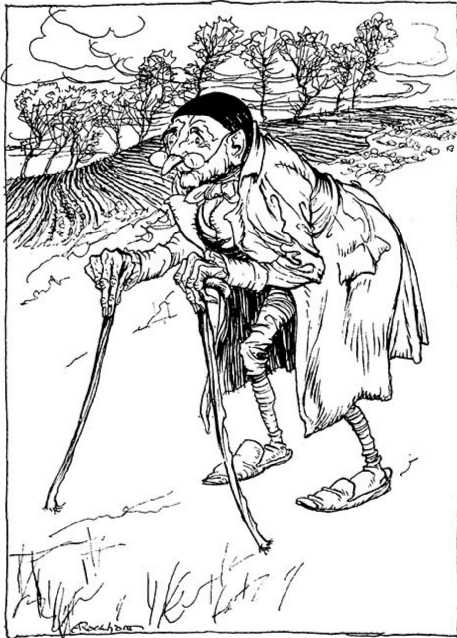
Peter was the most ancient inhabitant of the village ( p. 24 ).