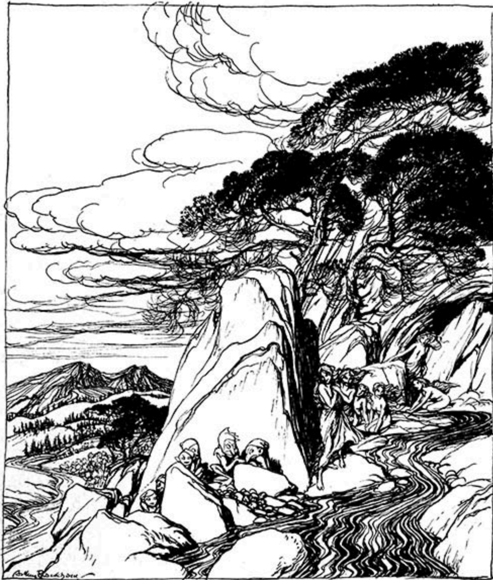
These fairy mountains.