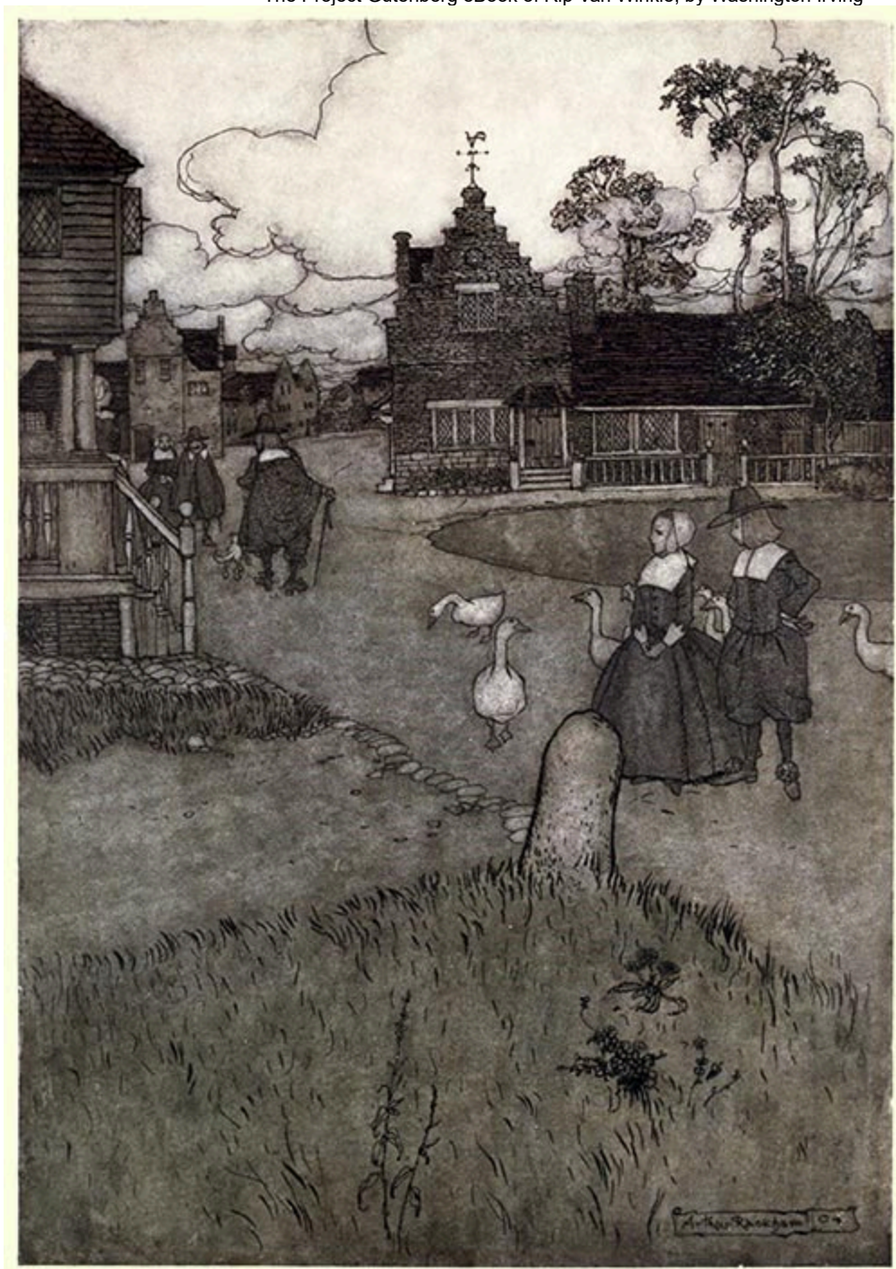
“Some of the houses of the original settlers.”