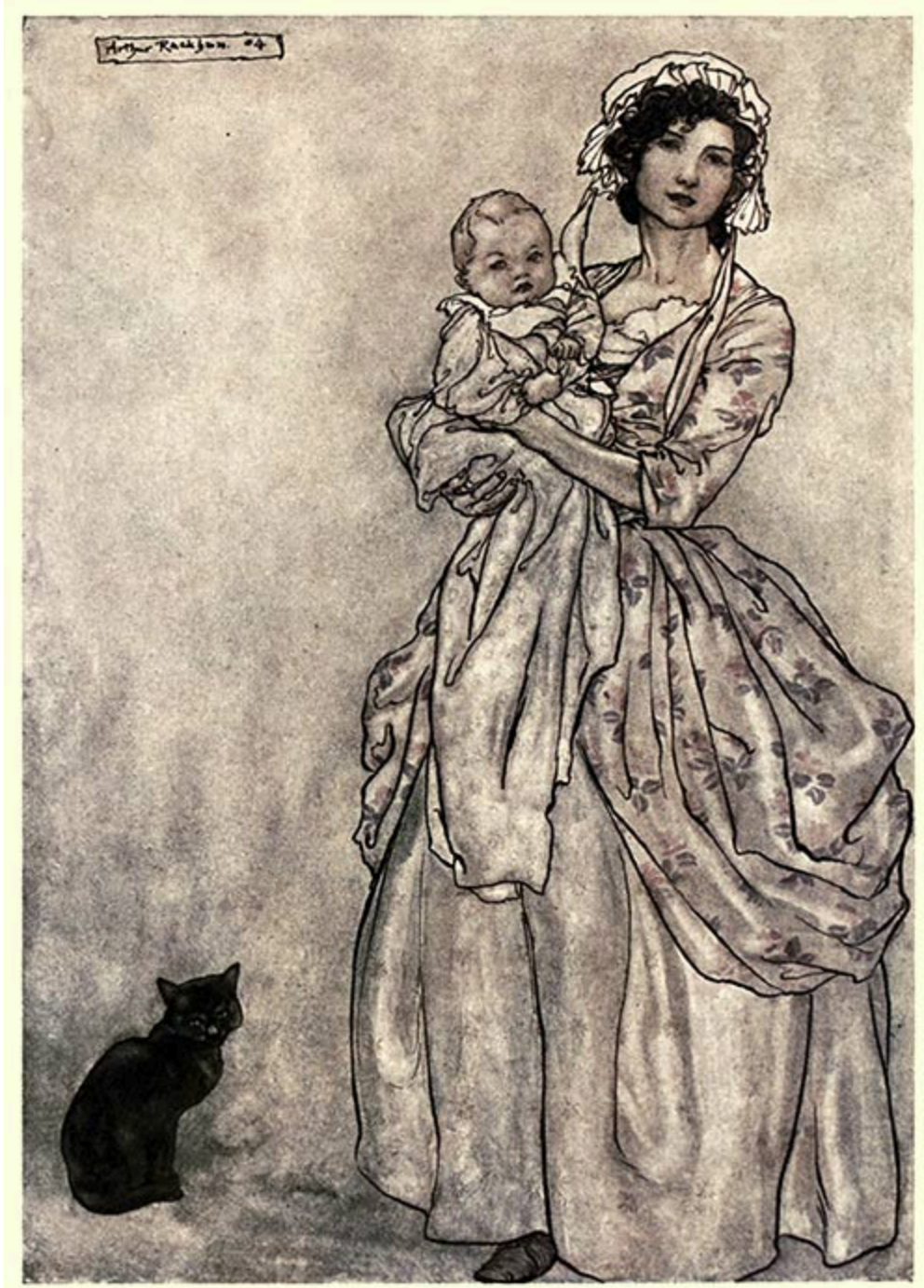
Rip's daughter and grandchild.