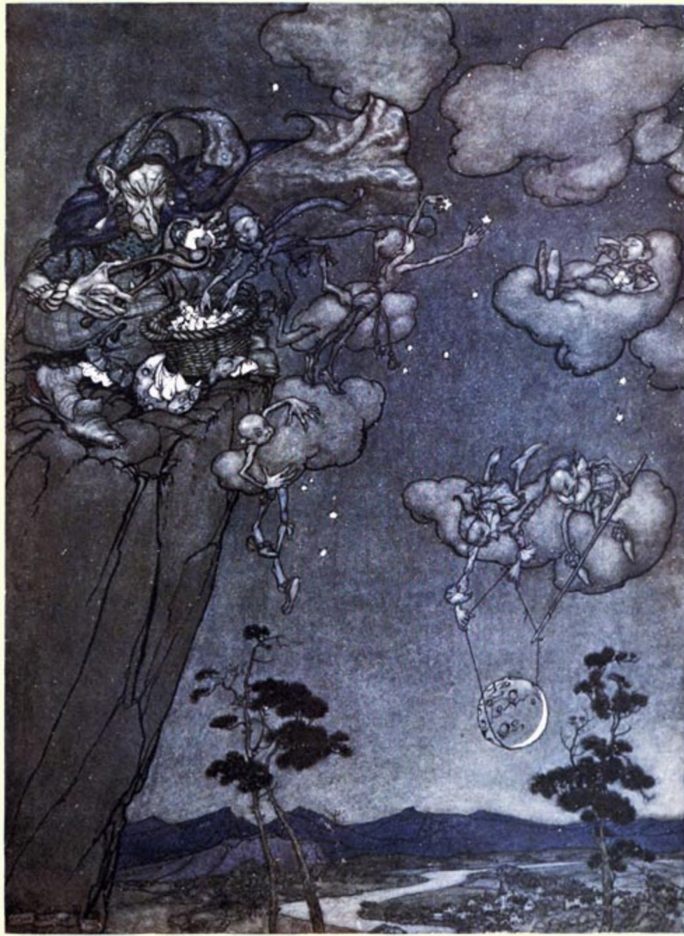
They were ruled by an old squaw spirit. See larger view